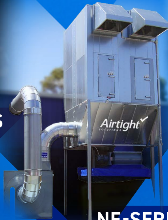
NF-SERIES REVERSE AIR FLOW DUST COLLECTORS