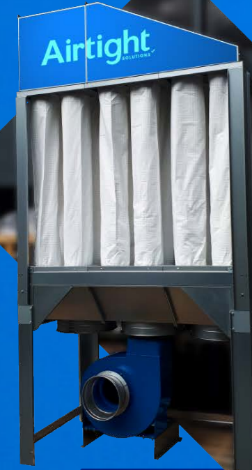
T-TYPES FILTER BAG DUST COLLECTORS