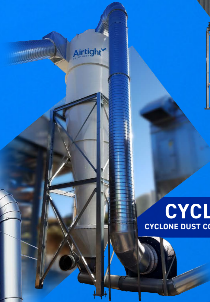
CYCLONES CYCLONE DUST COLLECTORS